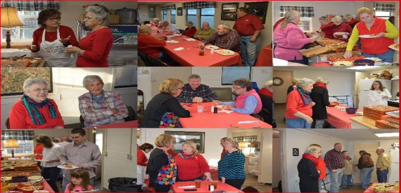
A time to celebrate with special people in our lives on Valentine's Day. 29 members attended the dinner composed of pizza and lasagna.